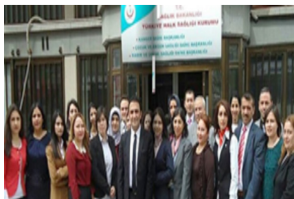
Figure 3 The young and motivated group of people who contributed to our success.

We are all proud of the country's change in cancer care, bridging Europe to other parts of the world. The country has not only had recent representation on the executive board of ESGO (European Society of Gynaecological Oncology), but also IPRI (International Prevention Research Institute), APOCP (Asian Pasific Organization for Cancer Prevention), ANCCA (Asian National Cancer Centers Alliance), OIC (Organization of Islamic Cooperation), UICC (Union for International Cancer Control), and IARC (International Agency for Research on Cancer), and has carried out more than 150 international presentations. Additional efforts in gynecologic oncology have included the implementation of ENYGO (European Network of Young Gynae Oncologists), ENGAGe (European Network of Gynecological Cancer Advocacy Groups), the ESGO Textbook of Gynecological Oncology, the ESGO Antalya State of Art Symposium on Prevention in 2016 (with 500 attendees), and the recent establishment of September 20th as World Gynecological Oncology Day (World GO Day, www.worldgoday.org ) in more than 20 countries globally. Turkey also implemented