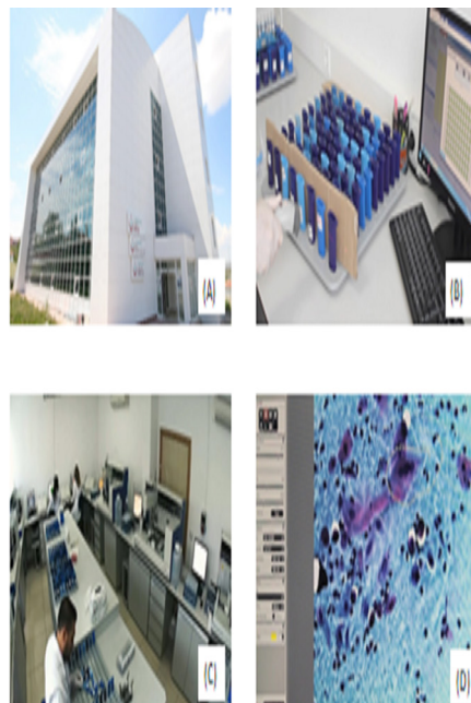
Figure 1 First Mega-HPV Laboratory in the World. 1A: Mega HPV Laboratory; 1B: Thousands of Pap-smear and HPV DNA samples come to the laboratory each day; 1C: HPV DNA screening machines; 1D: Reflex-smear digital pictures are stored.

reduction programmes, there are a number of active campaigns to monitor and evaluate the effects of asbestos, environmental pollution, and electromagnetic waves on our population. However, one of the most impactful changes has been the development of a successful cancer screening campaign. Turkey has become the first country in the world to have a primary HPV-DNA screening facility, with a mega-HPV laboratory serving the entire country 2 (Figure 1). In addition to a newly-implemented HPV-DNA cervical screening programme, screening has also been implemented for colorectal and breast cancer. In addition to establishing colorectal screening, the country was again the first in the world to start using centralized mammography reporting, including the use of out-sourced mobile trucks 3 (Figure 2).