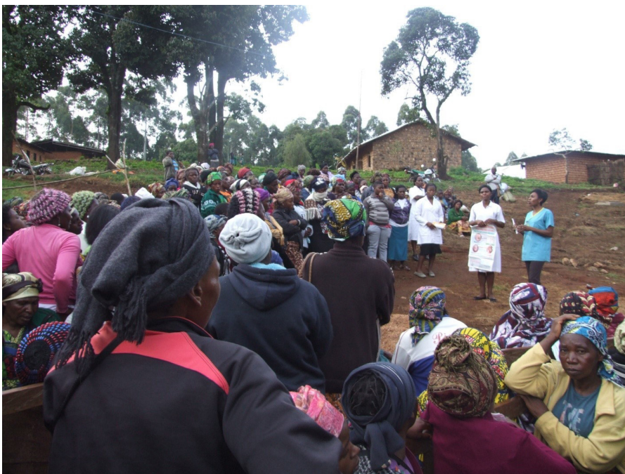
Figure 1 A campaign for cervical cancer screening organized by the Women's Health Program of the CBCHS in a rural village of Cameroon.

At the beginning of my cancer prevention training at MD Anderson in November 2017, I became acquainted with a simple and inexpensive telementoring tool—the Project ECHO (extension for community healthcare outcomes)—that connects community-based providers with distant specialty consultants. This model was developed to break up the monopoly of specialized knowledge and could be helpful to the WHP to maintain standard of care services to patients at lower cost, while reducing the need for patients to travel long distances to see specialists. With the MD Anderson ECHO leadership, I introduced the ECHO model to WHP nurses who welcomed it enthusiastically. In March 2018, I traveled to Cameroon to provide local stakeholders with a better explanation of Project ECHO, what is required to set up this tool, and how it can be used for capacity building of local staff and improve patient care (Figure 2). During this trip, I assessed the expectations of WHP nurses, and received their input on how to successfully implement this telementoring model within the WHP. Then, roles and responsibilities of each stakeholder were clearly defined, and after a Project ECHO orientation session at MD Anderson a couple of months later, a formal agreement between the CBCHS and the ECHO Institute was signed.