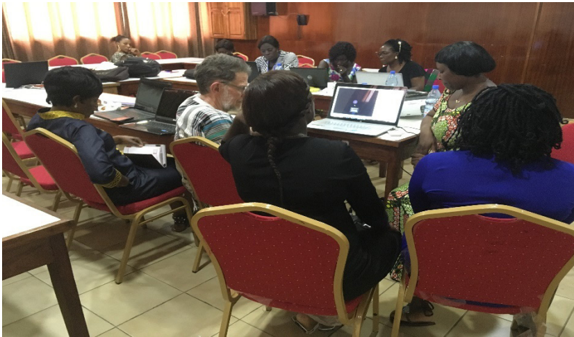
Figure 2 A meeting with Women's Health Program providers in Cameroon in March 2018, to talk about Project ECHO.

In June 2018, we officially started the Cameroon cervical cancer ECHO program. During each monthly ECHO videoconferencing session: (i) WHP nurses select and present two clinical cases to Faculty in the USA, Canada, and Africa, who provide expertise and feedback, and (ii) Faculty present a short didactic lecture on a topic of interest to WHP nurses (Figure 3A,B). These sessions are interactive, and focus on resources (including equipment and drugs) available locally that can be used to maximum advantage to provide better care to patients. Ten months later, the Cameroon ECHO program is very successful, with an increasing number of participants at each session, and positive feedback from local caregivers on the impact of this training model on their clinical practice and self-efficacy. The scope of these sessions has gradually expanded to the diagnosis and management of lower genital tract malignancies and human papillomavirus-related diseases. To date, providers from 10 other African countries have joined these ECHO sessions, and we are considering increasing the frequency of these sessions to twice a month. In view of the interest expressed by many French-speaking African countries