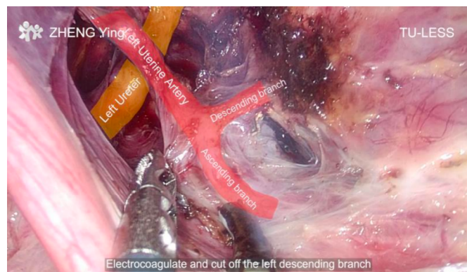
Figure 1 Exposure of uterine artery branches.