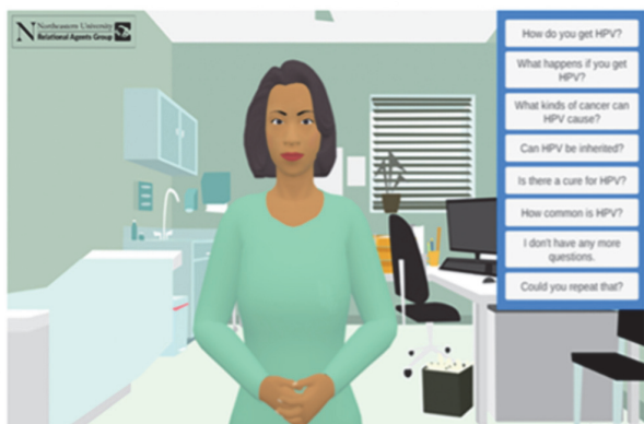
Abstract EPV232/#585 Image 1 Screenshot of RA

This pilot study assesses the acceptability of RA-based intervention and its impact on survivor intention to discuss vaccination.