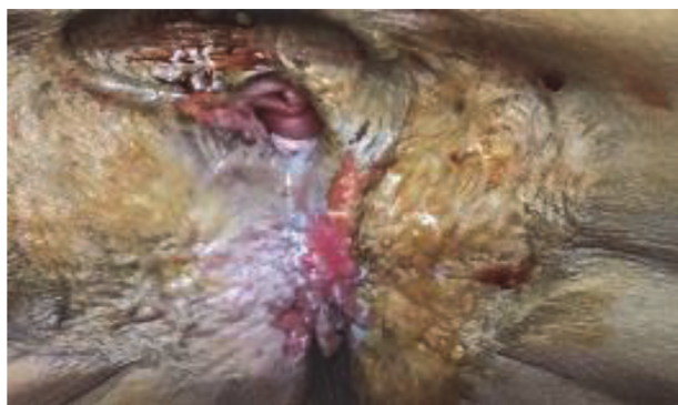
Abstract 60 Figure 1

Conclusion Retrodissemination is hypothesized as the etiology of Paget's spread in a split-thickness skin graft. Surgical