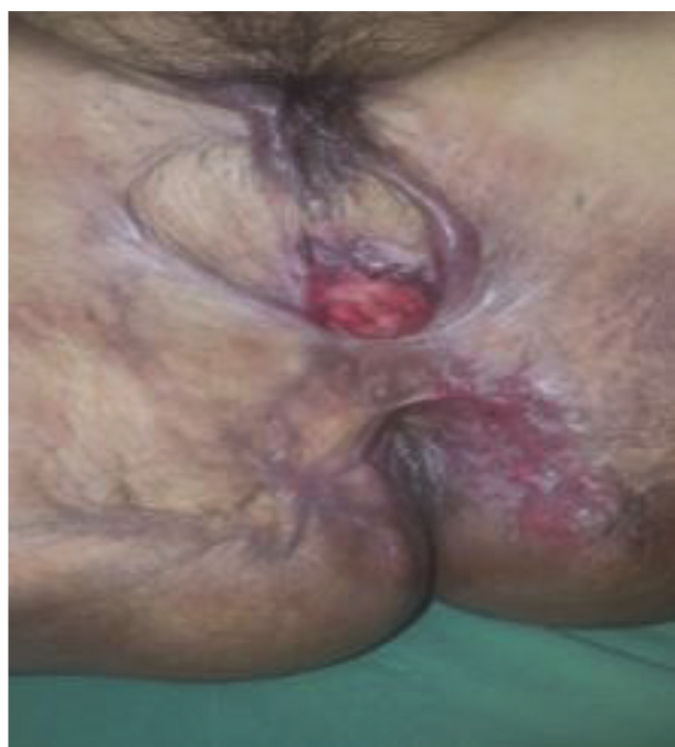
Abstract 60 Figure 2

challenges include removing the disease that may not be visible and minimizing morbidity from radical surgery. Imiquimod 5% can be used in recurrences. Despite the advances in the knowledge of EMPD of the vulva, the high rate of recurrent disease remains a challenge for optimal management and would require frequent and long-term follow-up.