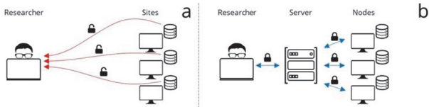
Abstract 2022-LBA-1282-ESGO Figure 1 Approaches to analysing data from different sources; a) Centralisation. This is the traditional approach, but has several disadvantages such as loss of data control logistics data governance and (most importantly) putting at risk sensitive patient data. b) Federated learning in this decentralised approach, privacy-sensitive patient data are not shared, but kept undisclosed and safe at their original location. Communication within the infrastructure is end-to-end encrypted