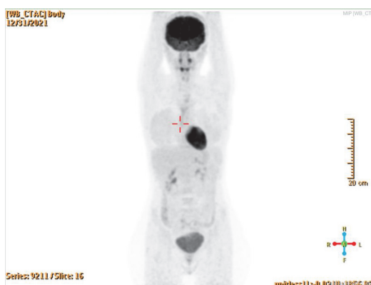
Abstract 2022-VA-699-ESGO Figure 1

Case Presentation A 30-years old patient who was diagnosed with cervical squamous cell carcinoma with a size of 2,1 cm, had no suspicious lymph node in the preoperative PET/CT and MRI scans. Thereupon, a fertility-sparing-trachelectomy operation was planned.