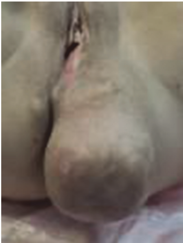
Abstract 2022-RA-786-ESGO Figure 1

Introduction/Background Angiomyxoma aggressivum is an extremely rare perineal tumor that expansively grows compressing the locally adjacent organs.